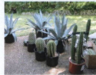
Landscaping with non-native plants

Streams are dynamic systems that change over time, according to the condition of the land around them. All of our streams are currently impacted by our activities.