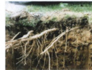
Damaged root systems