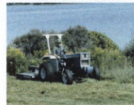
Mowing to the edge of streams