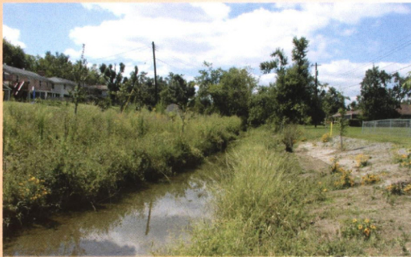
Riparian zones filter contaminants and reduce erosion.

A buffer zone is an unmowed vegetated area that is adjacent to a water source. Buffer zones reduce stream bank erosion, preserve the adjacent floodplain, and increase water quality by filtering pollutants. The larger the buffer zone, the more protection and water quality benefits a buffer zone will provide.