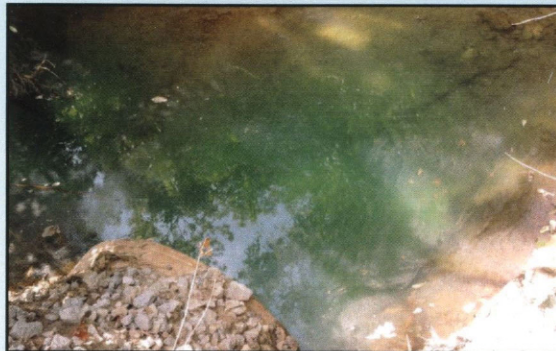
Untreated pollutants can leak into streams.

During a rainfall, water runs down streets and through yards, picking up substances along the way. This "runoff" often contains elements that pollute our waterways, harm wildlife, and degrade water quality.